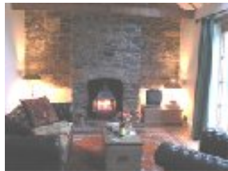
Relax around the fire...