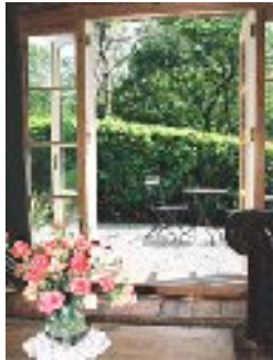
Looking out onto terrace