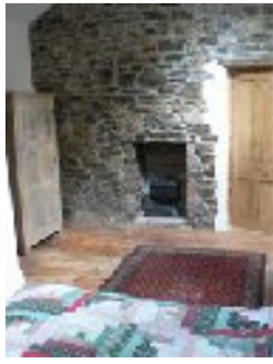
Another shot of the bedroom