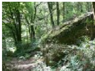
Old mine building on woodland walk