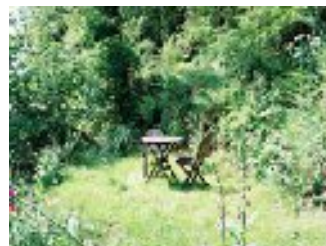
Woodland terrace seating