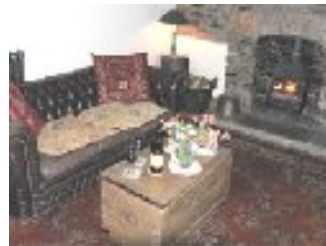
...put your feet up!