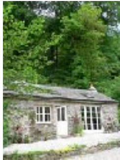
Front of property