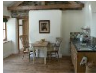
Kitchenette and breakfast table