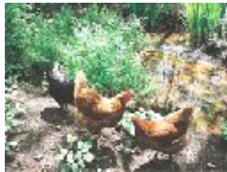
Hog's Tor chickens provide the eggs!